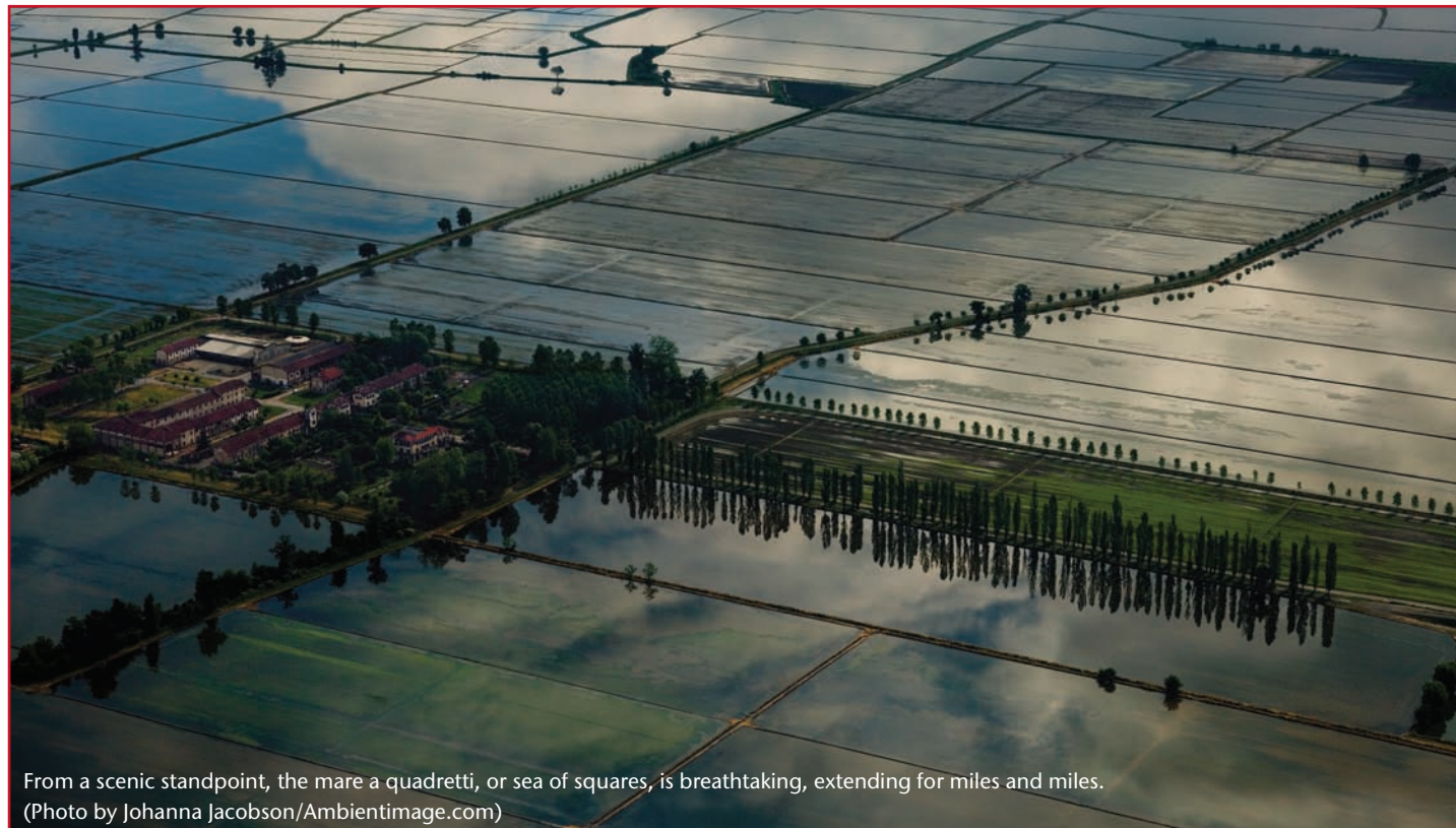
From a scenic standpoint, the mare a quadretti, or sea of squares, is breathtaking, extending for miles and miles.

Vercelli is the heartland of Italian rice—and is also the home of Gattinara and Ghemme, Nebbiolo-based wines that rival their Piedmont neighbors, Barolo and Barbaresco.